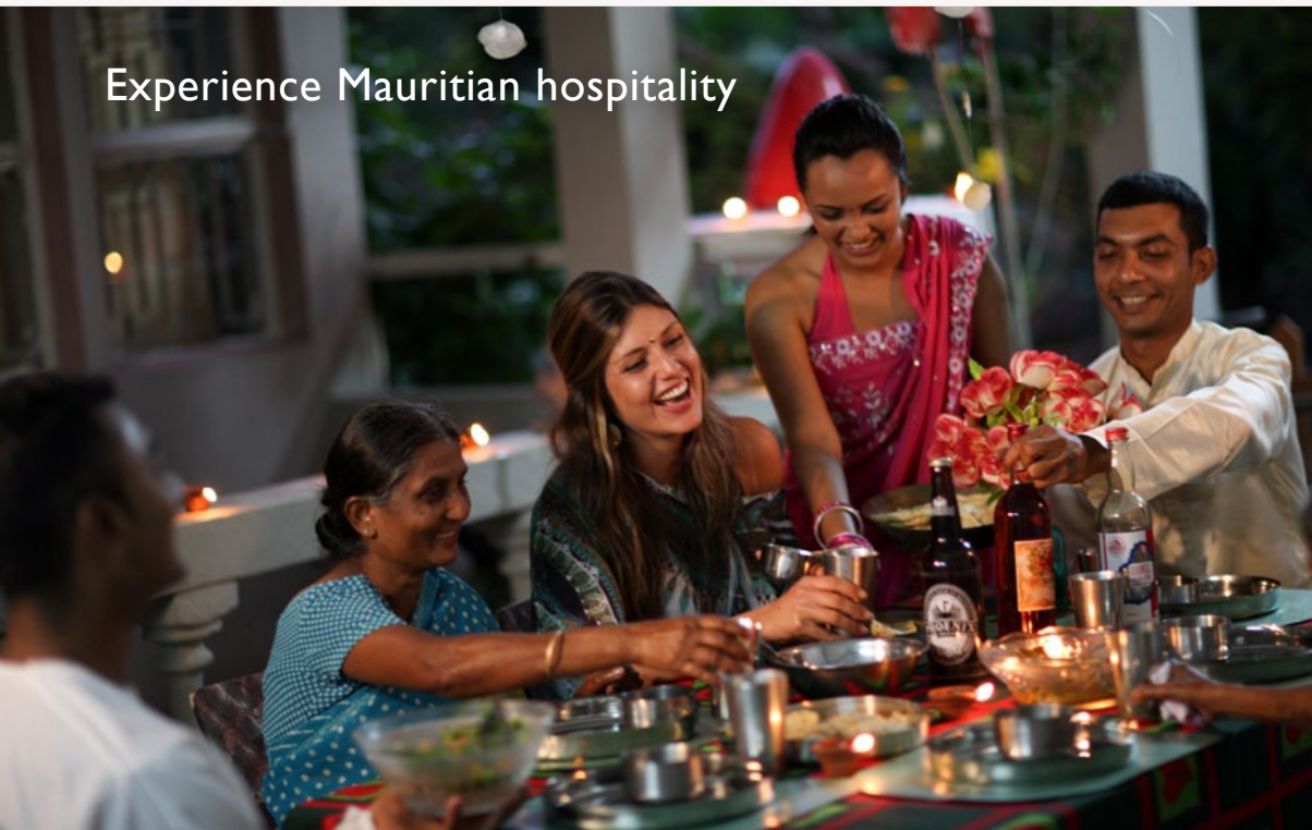
Experience Mauritian hospitality