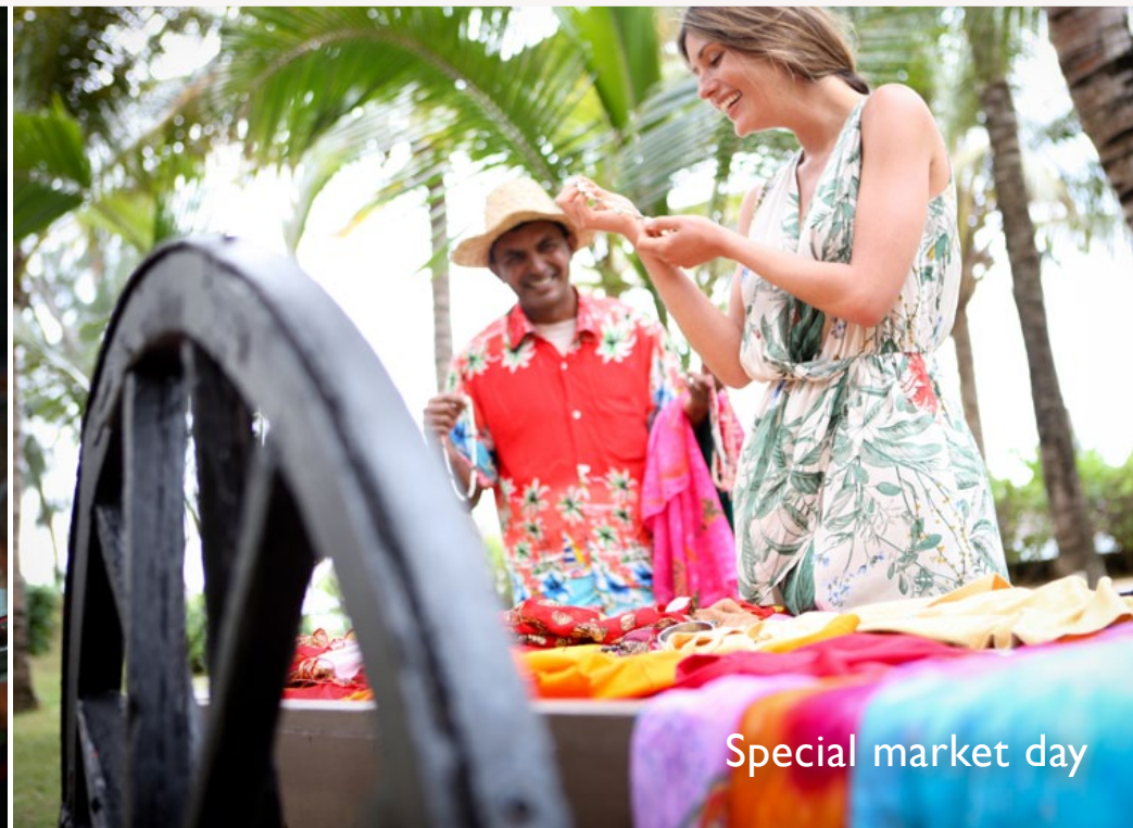
Special market day